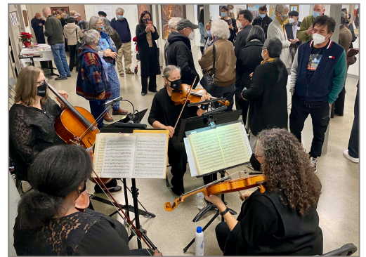
Dolcetto Quartet at Chasing the Light reception