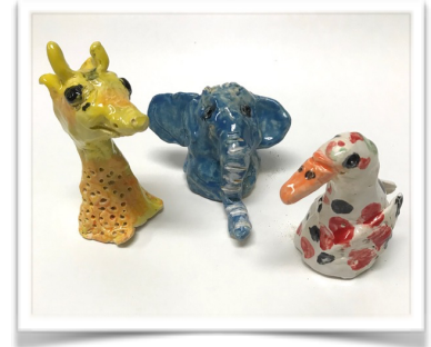
First grade ceramics, Esparto Elementary School

With schools re-opened, YoloArts' arts education artists in residence program is back in person in schools around the county serving elementary, high school, special education, and community school students - last year 1,690 students created art in our programs. Our goal is that students learn creative art making techniques that empower them to express their voices with confidence by creating a work of art they can be proud of.