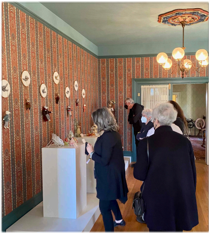
Side-By-Side Exhibition at The Gibson House, March 2022

Our public art galleries, Gallery 625 and The Barn Gallery, exhibited the work of 132 local and regional artists last year. We have been collaborating with the Yolo County Historical Collection to offer annual exhibitions and public programming around a central theme. In Spring of 2022 both The Barn Gallery and Gibson Mansion exhibited ceramics, the result of a partnership of YoloArts, the Yolo County Historical Collection and the National Council on Education for the Ceramic Arts (NCECA). Visitors were invited to view contemporary ceramics as well as look at items from the Historical Collection through the lens of contemporary artists who drew inspiration from the historic collection for their new works.