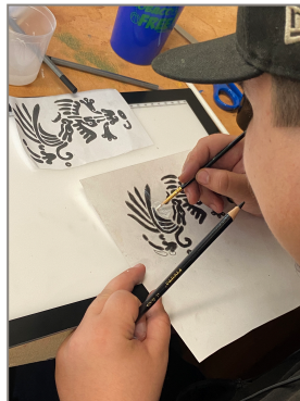
Art Program at Cesar Chavez Community School